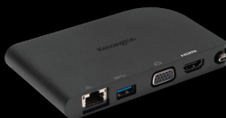
SD1500 USB-C Mobile Dock - K33969WW