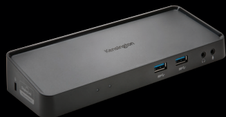
SD3600 USB 3.0 Universal Dock K33991WW