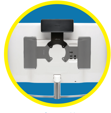
VESA® mountable (adapter plate sold separately)

Introducing the SD4700P Universal Docking Station USB-C™ and USB 3.0 Connectivity in One Dock