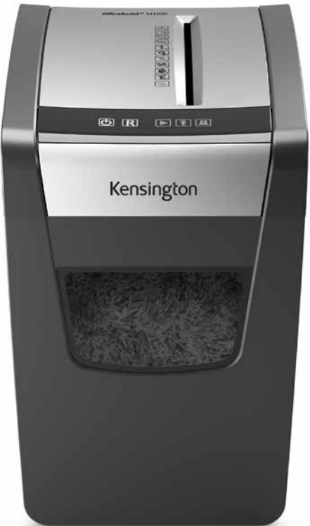
OfficeAssist™ M100S Anti-Jam Cross Cut Shredder