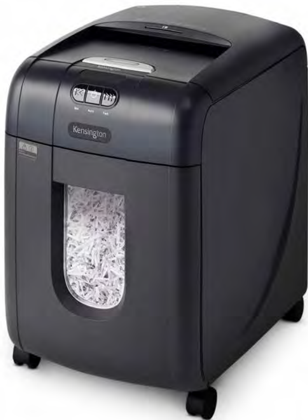
OfficeAssist™ Auto Feed Shredder A1300 Anti-Jam Cross Cut