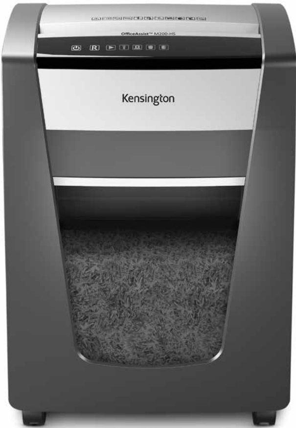
OfficeAssist™ Shredder M200-HS Anti-Jam Micro Cut