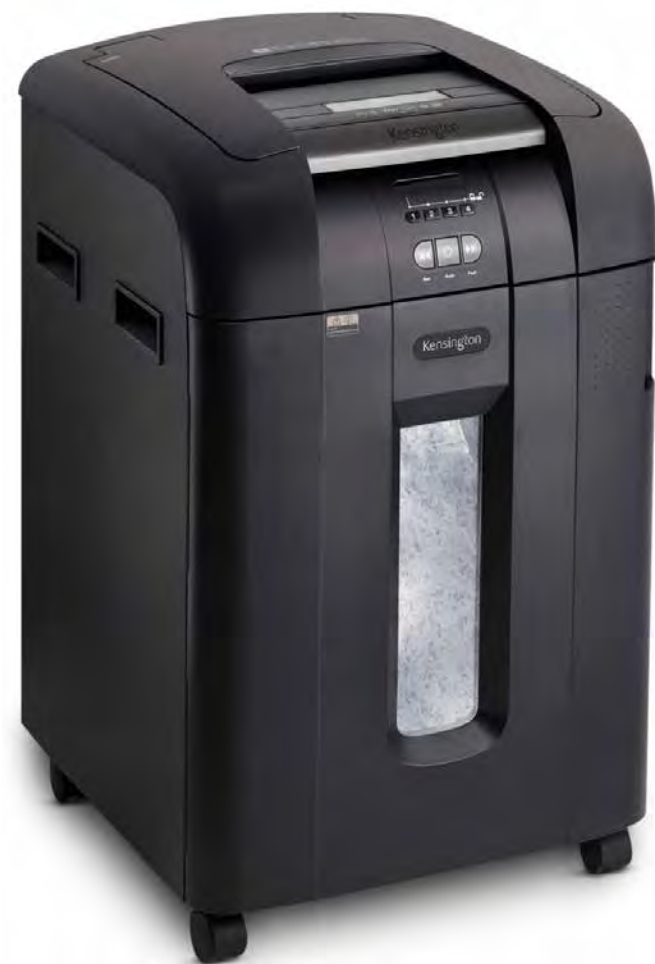
OfficeAssist™ Auto Feed Shredder A6000 Anti-Jam Cross Cut