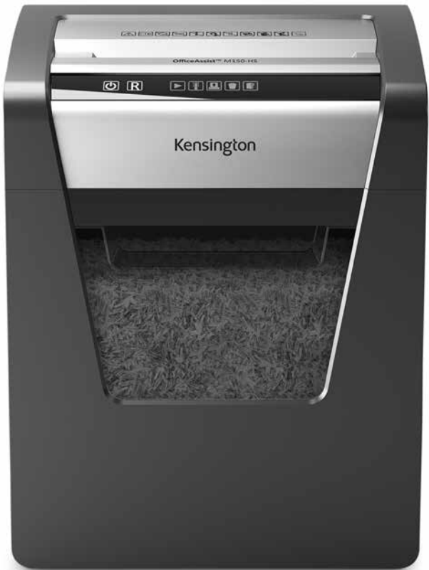
OfficeAssist™ Shredder M150-HS Anti-Jam Micro Cut