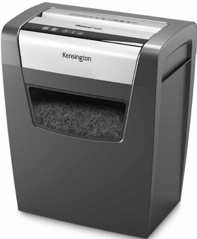
OfficeAssist™ M100 Anti-Jam Cross Cut Shredder