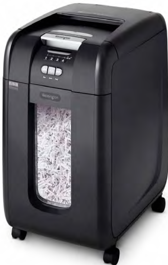
OfficeAssist™ Auto Feed Shredder A3000 Anti-Jam Cross Cut