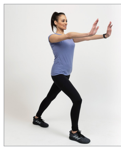
Calf Stretch: Lean into wall with one leg in front of the other. Try to keep heel of back leg planted and gently increase the amount of forward lean. Repeat for other side.