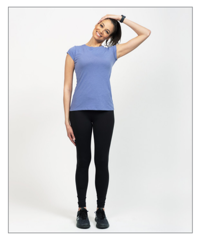
Lateral Neck Stretch: Stretch ear gently toward shoulder until a stretch is felt in lateral neck. Repeat for other side.

Hold all stretches for ~30+ seconds and repeat as desired. Never stretch to the point of pain.