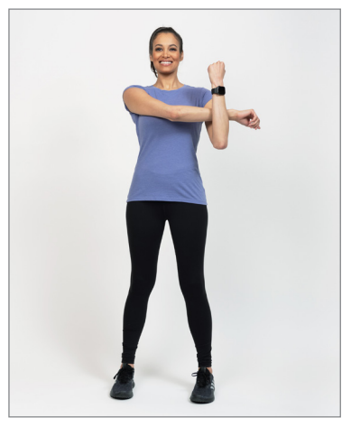
Shoulder Stretch: Reach arm across body at shoulder height, using opposite arm to gently increase the stretch. Repeat for other side.