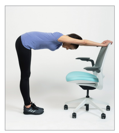
Hamstring Stretch: With knees straight but slightly relaxed, bend at the waist, keeping the back straight. Can use chair or wall for balance and extra stretch.