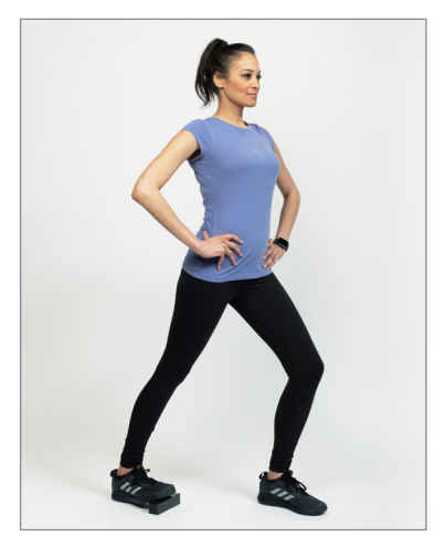
Calf Stretch: Prop toes of one foot on a small object. Carefully step forward with opposite foot. Repeat for other side.

Hold all stretches for ~30+ seconds and repeat as desired. Never stretch to the point of pain.