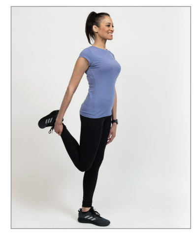
Quadriceps Stretch: Using a wall, chair back, or countertop for balance, keep knees together and bend one leg to grab the ankle behind body. Gently pull foot toward buttocks. Repeat for other side.