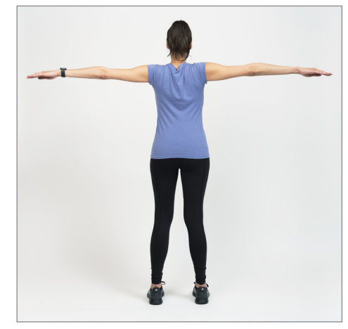
"T" Stretch: With both arms raised away from sides at approximately shoulder height, squeeze and hold shoulder blades together.