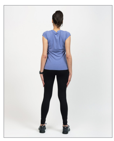
Shoulder Blade Squeeze: Retract both shoulders and try to squeeze shoulder blades together.