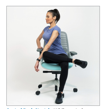
Seated Back Stretch: While seated, cross one ankle over the other knee. Gently turn torso toward the side of the top (bent) knee. Repeat for other side.