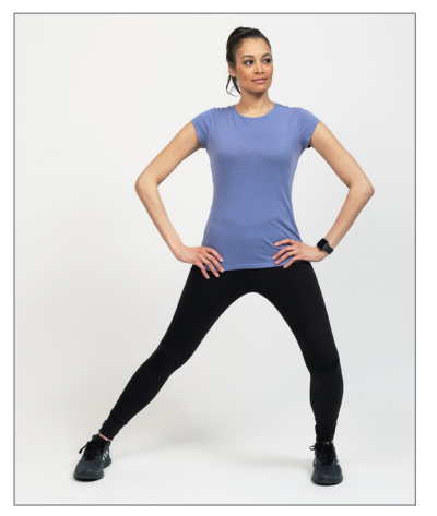
Side Lunge: With feet wider than shoulder-width apart, bend one knee and distribute most weight to that side. Stretch should be felt in inner thigh of opposite leg. Repeat for other side.