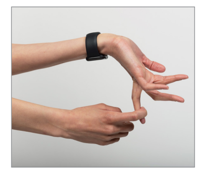
Carpal Tunnel Stretch: With palm facing up, pull fingers so they point downward. Using opposite hand, take turns extending each finger. The stretch will be felt from fingers up through forearm. Repeat for other side.