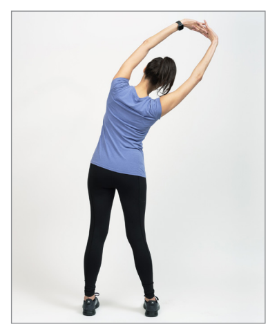
Lateral Side Bend: Interlock hands with arms overhead and gently bend the torso laterally to either side. Repeat for other side.